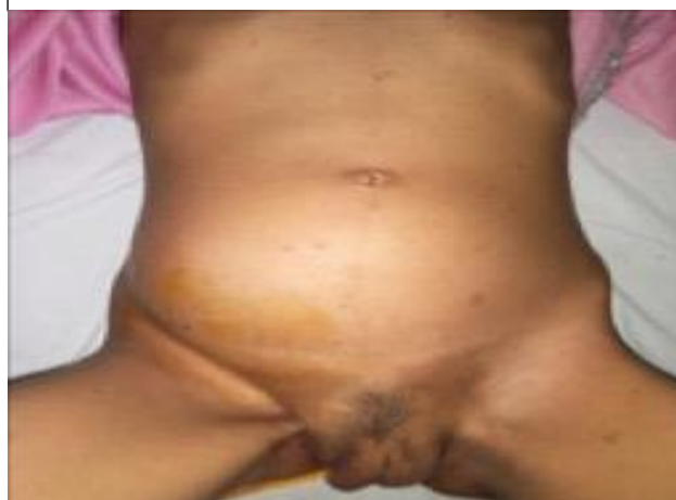
Figure 4. Large abdomino-pelvic mass (Pyometra) with clitoromegaly.