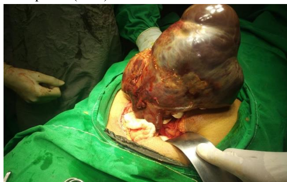
Figure 1. Intra-operative photograph showing large right ovarian cyst, after detorsion.

One 12 years old female patient was referred from gynaecology department with large abdomino-pelvic lesion with clitoromegally (Figure 4). CECT abdomen and pelvis was done before intervention. In view of absence of peritonism and fever with exclusion of hydatid disease, percutaneous pigtail catheter drainage was done under local anaesthesia under ultrasonographic guidance. About two litres of pus drained, symptoms improved and distension subsided. Patient is being evaluated for disorders of sexual development (DSD).